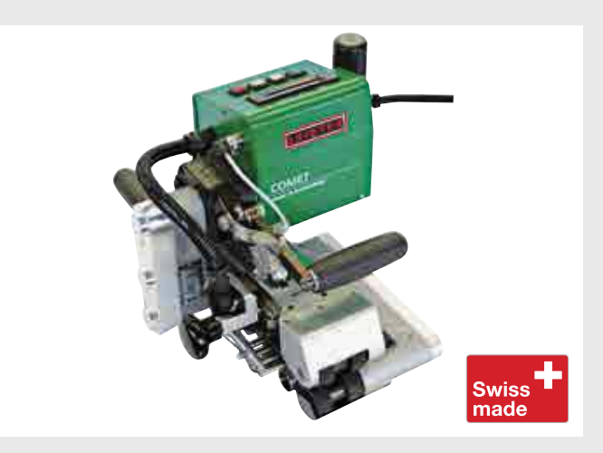
Wedge welder COMET USB

Included with purchase: Welder, manual, guide-bar short, storage case