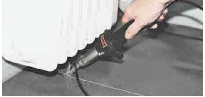
Especially suited to facilitate tasks in difficult to access areas.

As the most compact hot-air hand tool from Leister, the HOT JET S' low weight of 600 grams (including cord and slim handle) ensures high-powered, fatigue-free welding.