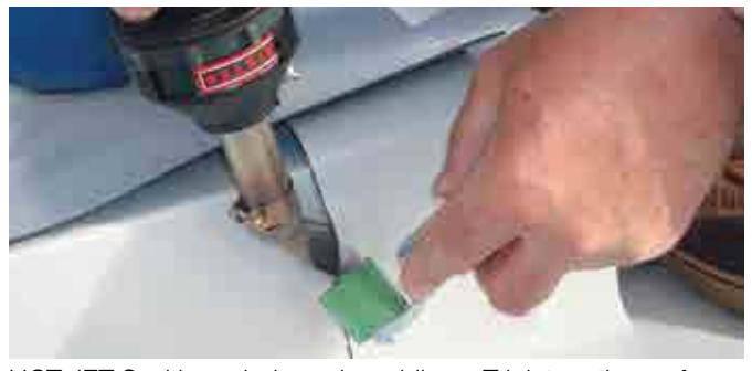
HOT JET S with angled nozzle welding a T-joint on the roof.