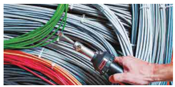
Fitting a solder shrink connection with the HOT JETS outfitted with a push-fit sieve reflector.