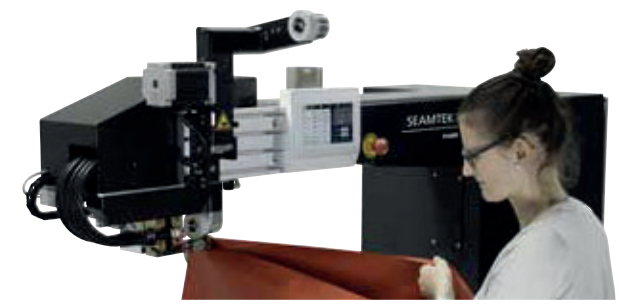
New, innovative welding wedge solution.