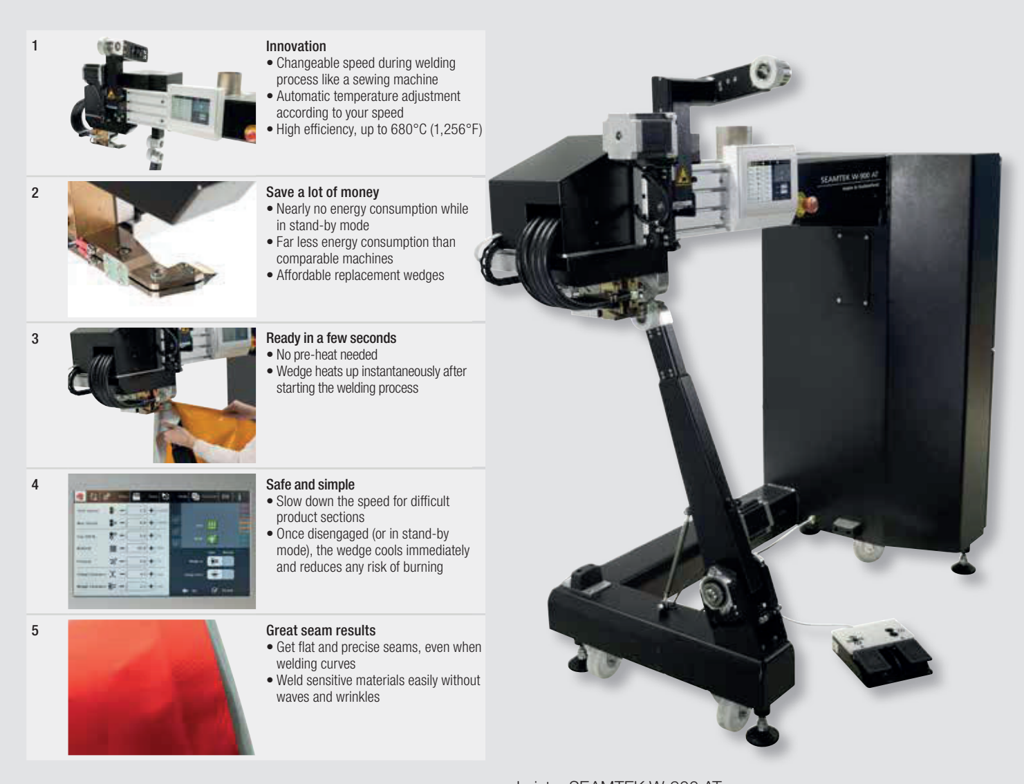
Leister SEAMTEK W-900 AT

Based on the proven SEAMTEK W-900AT is this the first machine worldwide with this new and innovative low voltage wedge technology. With the genuine innovation of variable speed during welding process, this machine will change your welding experience. Weld the best possible, highest quality seams. Meet the world champion in efficiency.