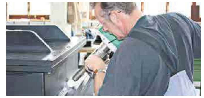
The powerful WELDPLAST S4 in use.

The WELDPLAST S4 is the first extruder of its kind with a brushless, maintenance-free motor for generating preheated air. Output of up to four kilograms per hour is made possible thanks to the S4's powerful drive system.